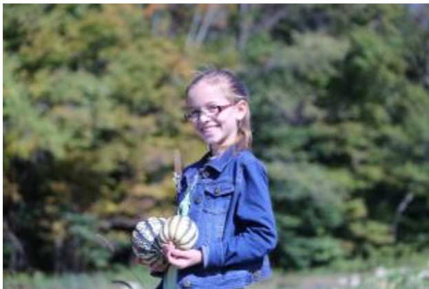
8 - CRCS AgriTech