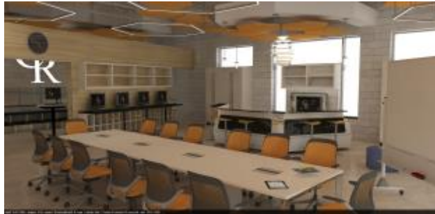
4 - Furniture on wheels allows flexibility and the best setup for any occasion.