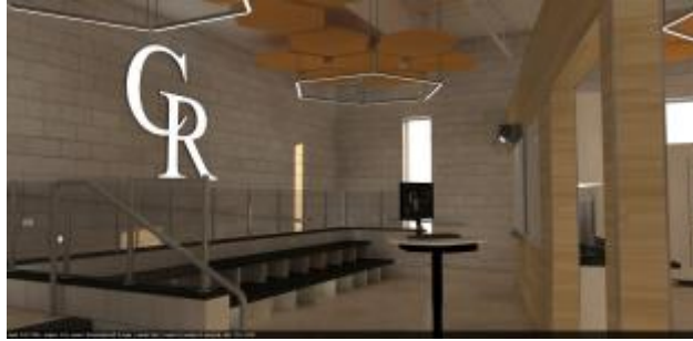
3 - Simple stadium steps allow for easey initial "campfire" gatherings.