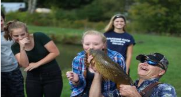
6 - CRCS Outdoors