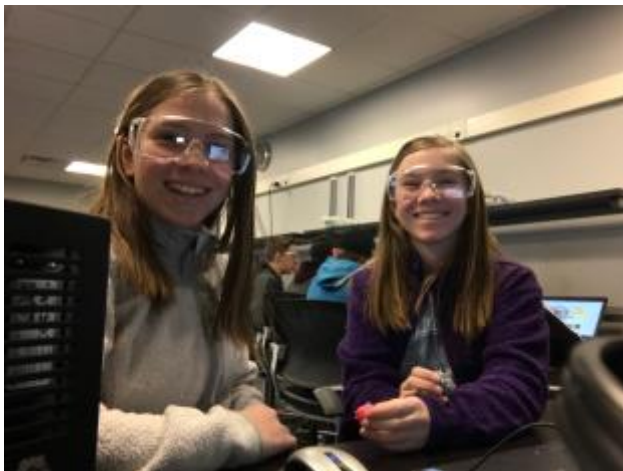
9 - GLEAM