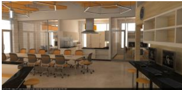
5 - Kitchen area and small group rooms encourage conversations at the "watering hole" or small group projects in the "cave".