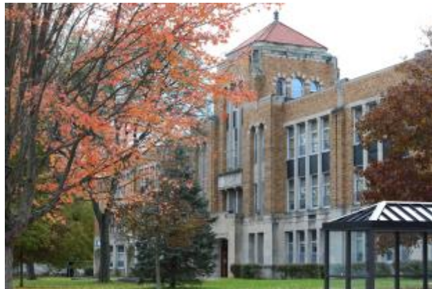
1 - Groundbreaking Being Scheduled

Cuba-Rushfords Capital Project Periodic Newsletter.