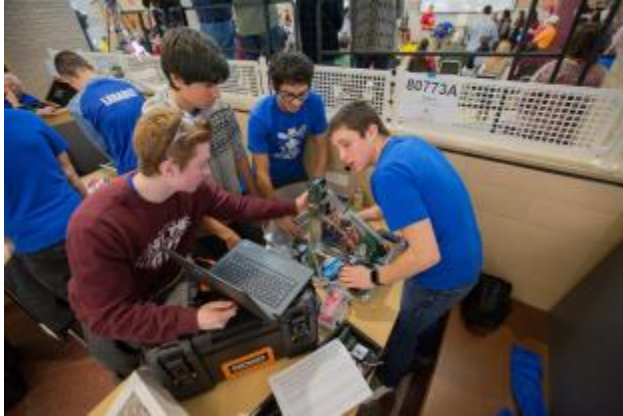
7 - VEX Robotics