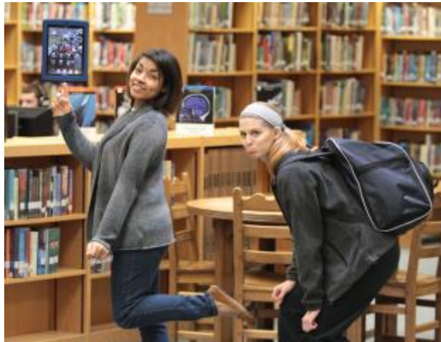
10 - Every Student, Everyday

https://sway.office.com/nc3AZiym6LNRZ10T